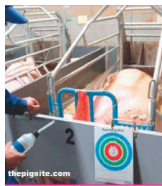
Farrowing disc from AHDB Pork