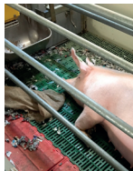
Hessian sack affixed to crate to provide outlet for nesting

Caution Only give oxytocin as a last resort. Avoid giving to gilts. Use a longer acting oxytocin analogue if necessary to stop large surges in uterine pressure. Ask your vet.